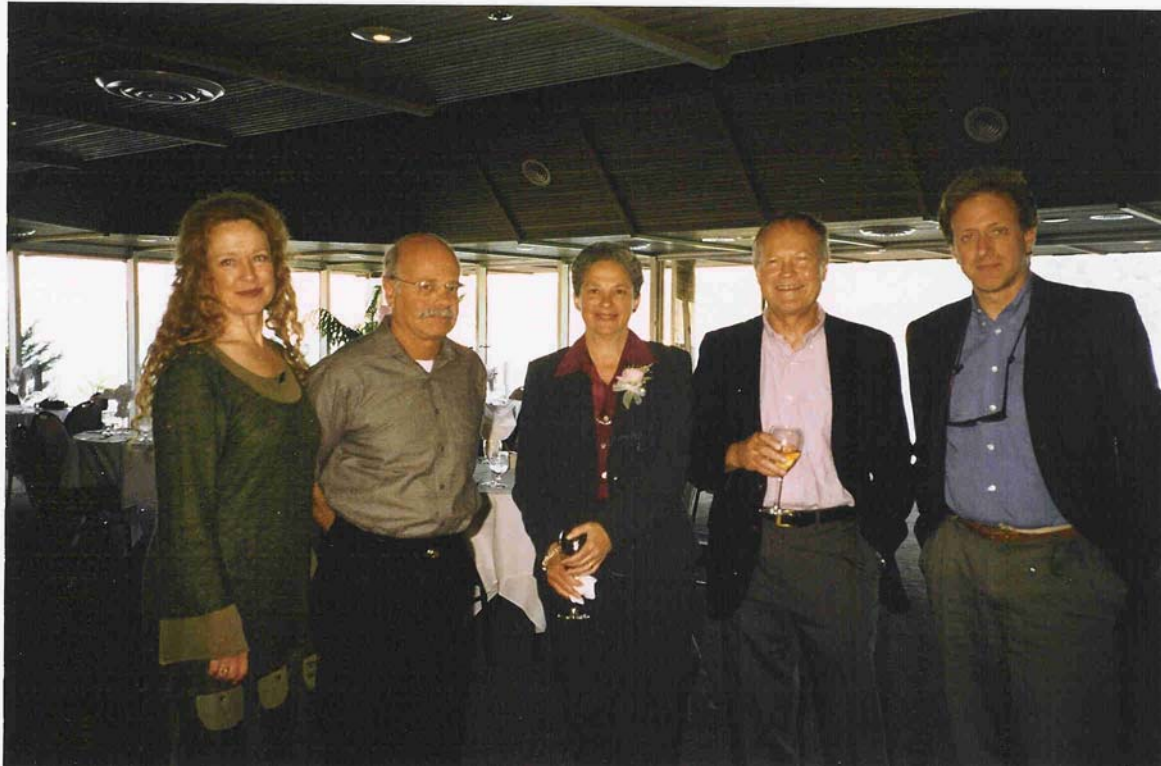
My retirement party October 2000